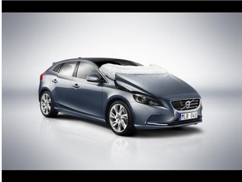
Volvo's Pedestrian Airbag Technology System

A more recent innovation, developed by Volvo Car Corporation, has been the deployment of an external air bag that both lifts the hood in order to create deflection space, and provides a shield over the bottom of the windshield frame and the lower portions of the front roof pillars to protect against head contact with these stiff structures.